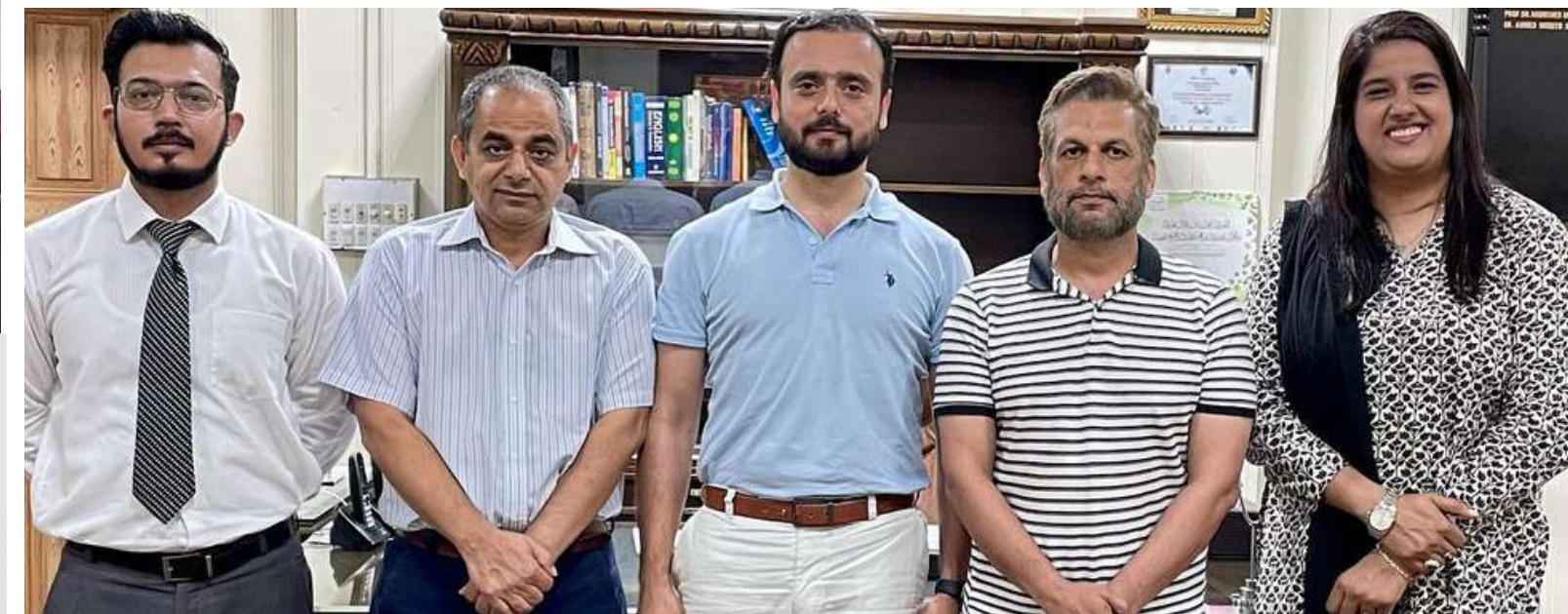
HCBF ALUMNI ASSOCIATION MEETS WITH THE PRINCIPAL