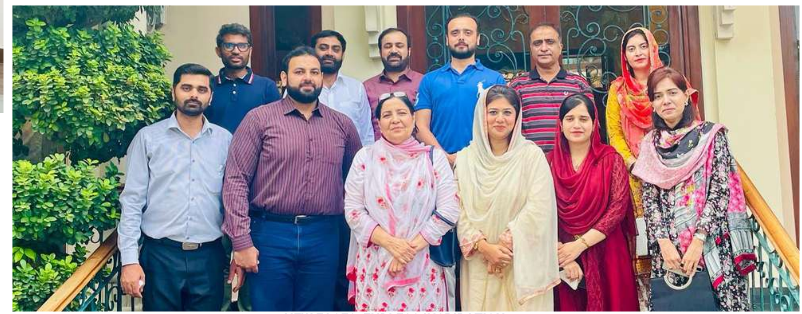
NEW FACES, ENDLESS INSPIRATION OUR NEWLY INDUCTED FACULTY MEMBERS ORGANISED AN UNFORGETTABLE GET TOGETHER